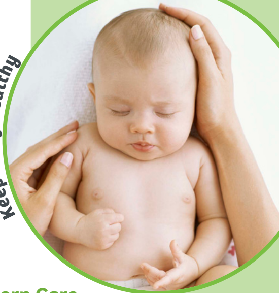
Keep Baby Healthy