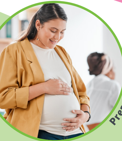
Prepare for Baby