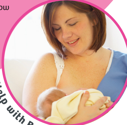
Help with Breastfeeding